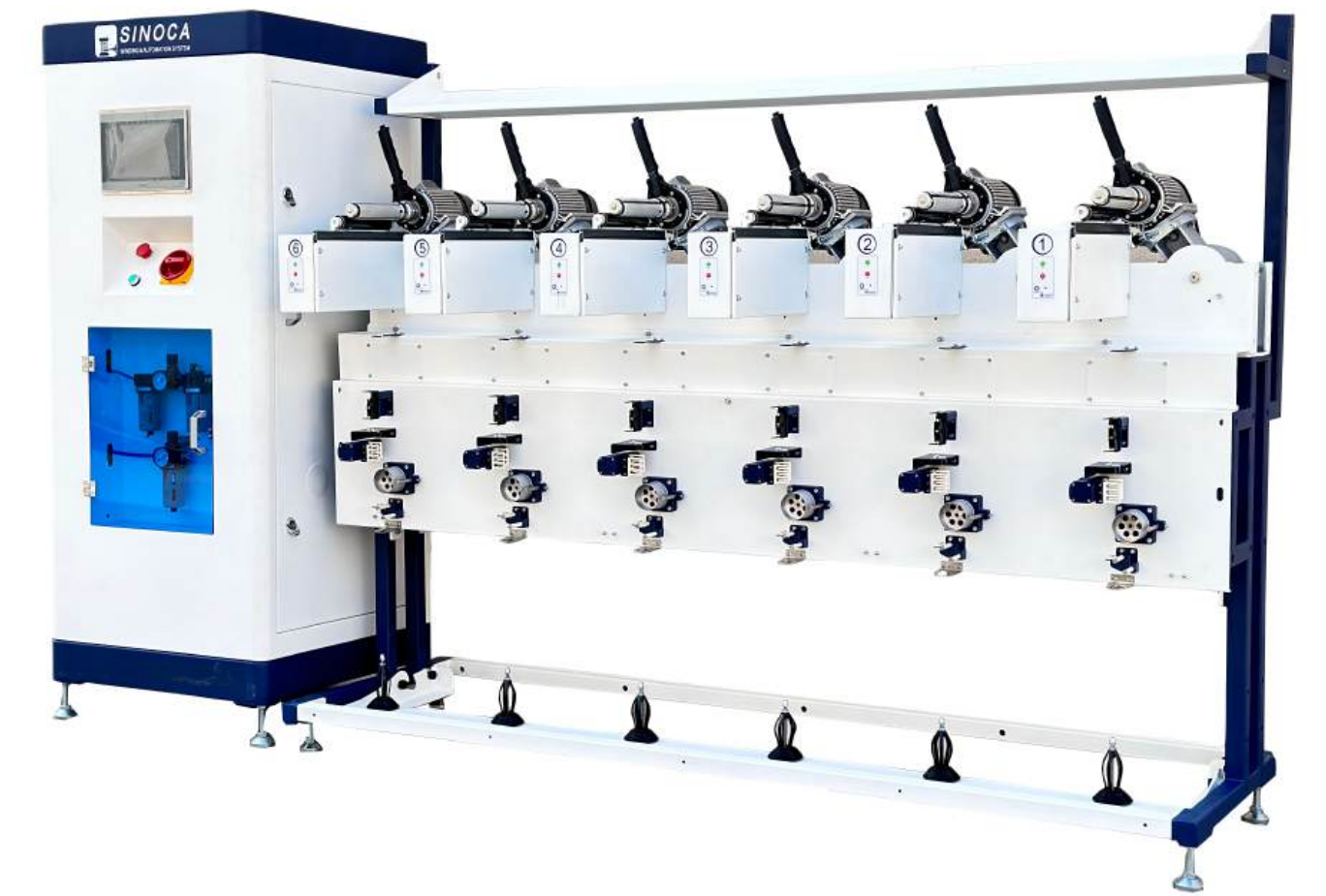
Brushless DC Winding Motor 直流无刷卷绕马达